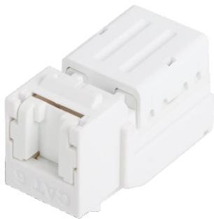
NMC-KJUE2-ST-WT RJ45/8P8C, UTP, .6

NMC-KJUA2-ST-WT ( .6a), NMC-KJUE2-ST-WT ( .6) NMC-KJUD2-ST-WT ( .5e)