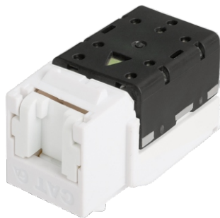
NMC-KJUA2-ST-WT RJ45/8P8C, UTP, .6a